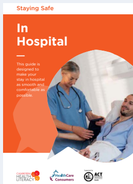
Staying Safe – In Hospital